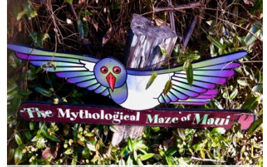
Maui's Maze sign

HOW MANY DIFFERENT LEAF SHAPES CAN YOU FIND?