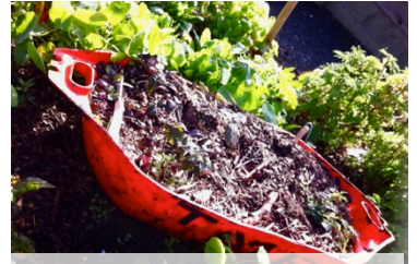
Red Boat Planter Box