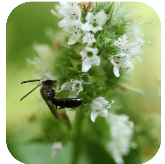
Hylaeus species foraging

Draw your own yellow markings on the mask – try and make your design symmetrical. Colour the rest of the head in black. Cut carefully around the outline, nose piece and eye holes – tailor to fit your face shape and size. Attach mask with string or a strip of paper. We'd love to see your photos – share them with us on Facebook.