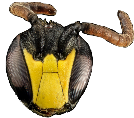
Distinctive yellow face markings