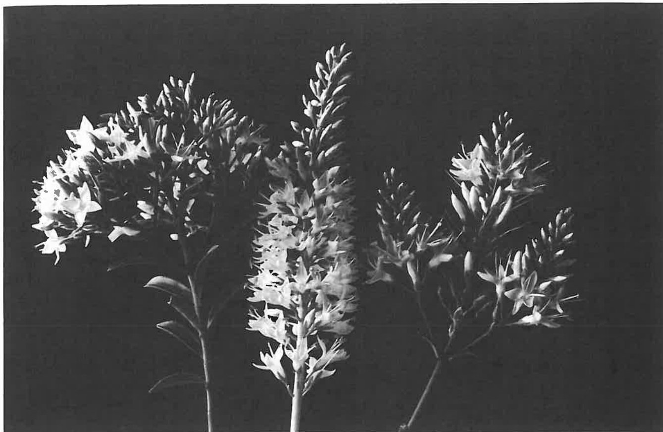
Fig. 1 FH 76. Left: H. diosmifolia (branched inflorescence). Centre: H. bollonsii (simple inflorescence). Right: Hybrid between H. diosmifolia and H. bollonsii . This illustrates how most hybrid characteristics are intermediate between those of the two parents.