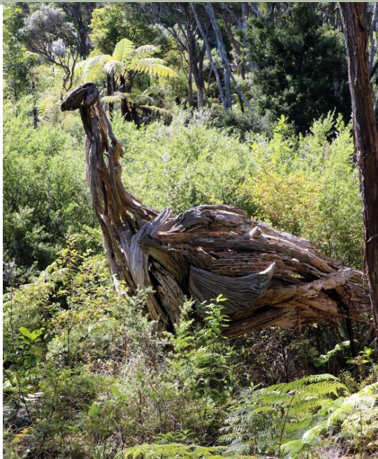
Scenes from Omaio (above) and Two Paddocks.