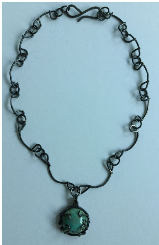
Pixi Parasol, forged sterling silver, with enamel.

my work - each piece has a narrative: bought for special anniversaries, birthdays and reminders of a happy visit to the gardens by locals and overseas visitors.