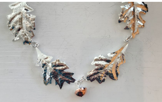
Necklace from sterling silver repousse leaves, with sterling and copper raised acorn.

uses to create her jewellery. During Brenda's time at the Gardens we also had two other displays: the main atrium presented Epic Voyages where we explored how plants