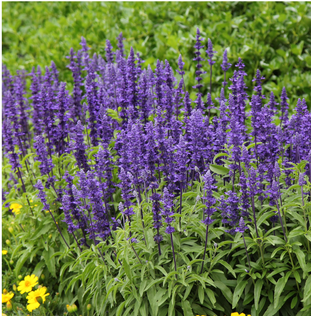
Salvia farinacea 'Victoria'