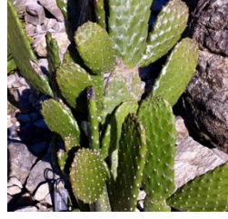
tiotio / cactus