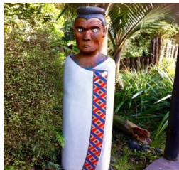
pakoko / statue