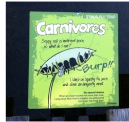
carnivorous plant sign