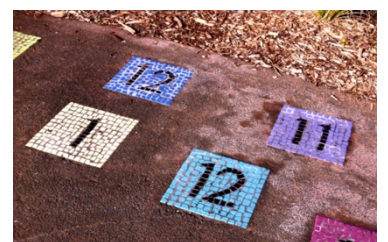
sun clock numbers

HOW MANY OF THESE LEAF SHAPES CAN YOU FIND IN THE GARDEN?