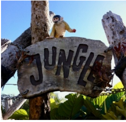
makimaki / monkey