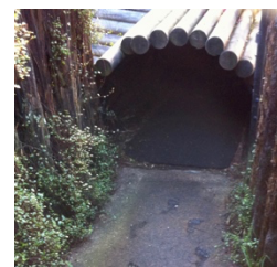
anaroa / tunnel