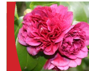
Camellia japonica 'Takanini' Vigorous upright growing evergreen shrub. Great hedge, specimen tree or in a pot. Grows to 3m x 2m. Early flowering for up to 5 months.