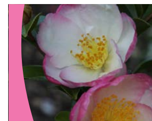
Camellia sasanqua x fraterna 'Yoimachi' Slender upright growth habit. Fragrant miniature white flowers with pink margins, can flower for up to 6 months.