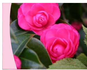
Camellia x pitardii hybrid 'Adorable' A vigorous, upright evergreen shrub with glossy green leaves and bright pink spring. Plant in well-drained acid soil.