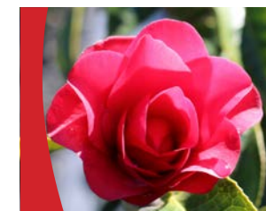
Camellia japonica 'Roger Hall' A vigorous compact upright evergreen shrub with large bright red flowers. Suitable for containers, courtyards, features and hedging.