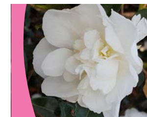
Camellia sasanqua 'Paradise Helen' ^ Grows rapidly and is ideal for hedging, topiary, containers or as a specimen shrub.