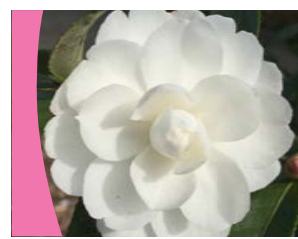
Camellia sasanqua 'Early Pearly' Double white blooms from early autumn to early winter. Upright and vigorous habit, growing to 2m x 1.5m.