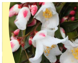
Camellia transnokoensis A pretty evergreen with small leaves and upright growth habit. Ideal for screening or hedges, it grows to 5m x 2m.