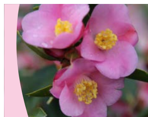
Camellia transnokoensis hybrid 'Transpink' Masses of tiny fragrant single pink flowers from winter to spring. New foliage is reddish. Dense, upright growth.